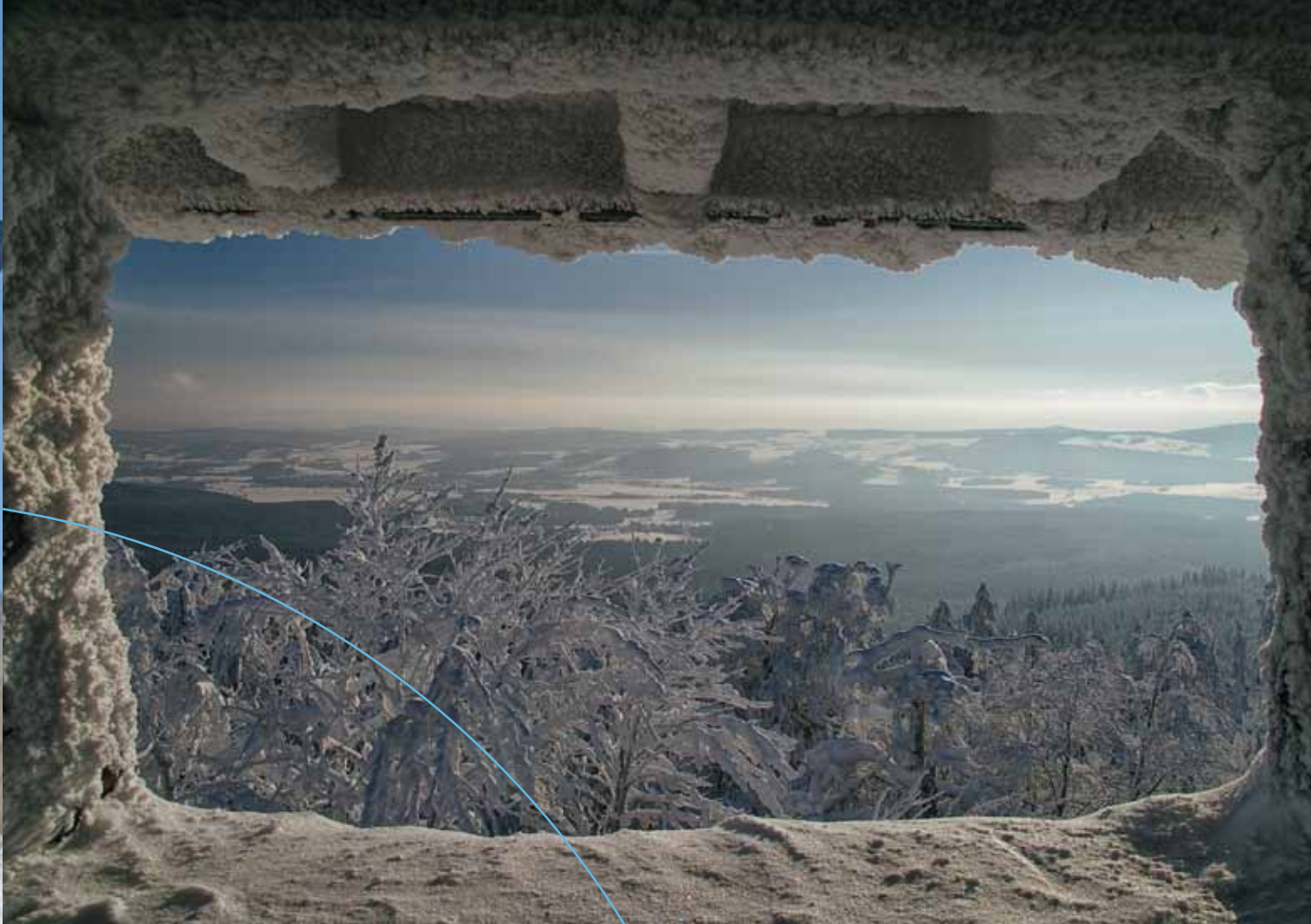
View from the Kösseine Tower