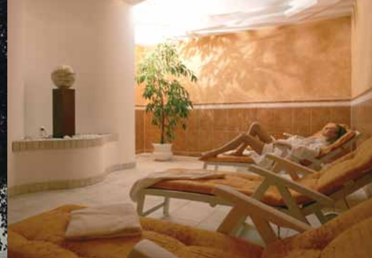
Wellness in Bad Alexandersbad