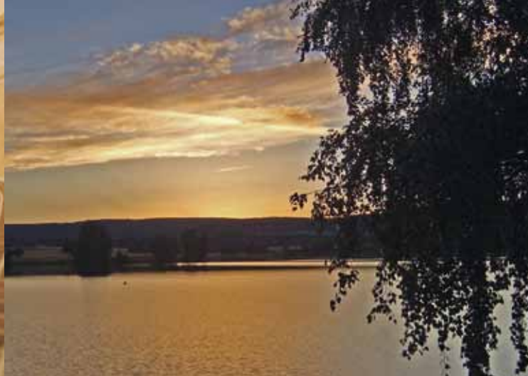
Evening atmosphere at the lake of Weißenstadt