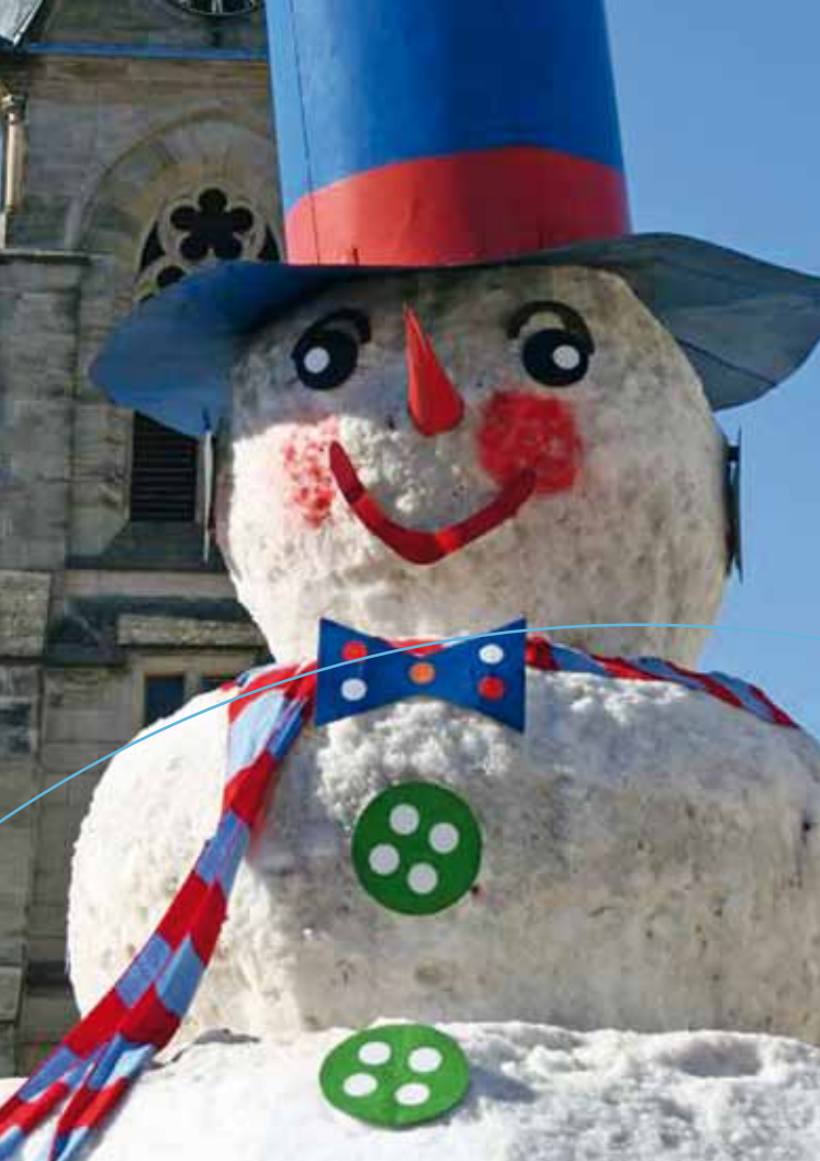
Building a snowman in Bischofsgrün