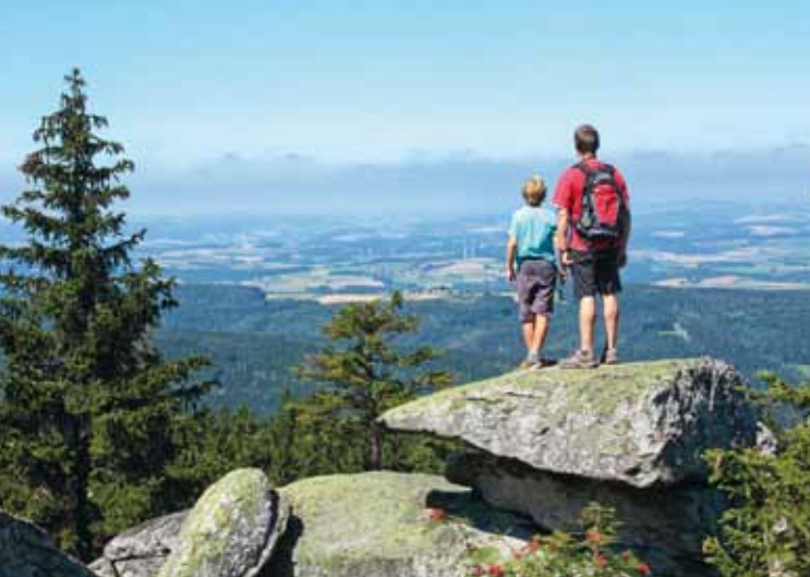
On the Ochsenkopf