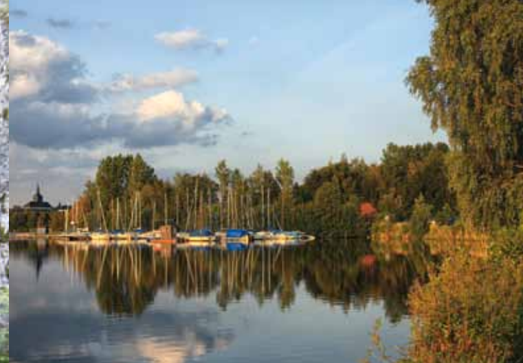
Lake of Weißenstadt