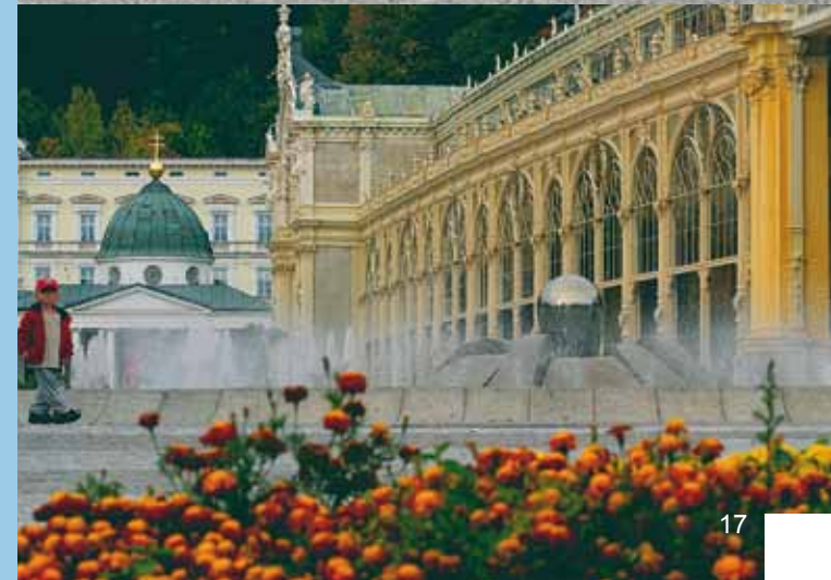
Marienbad, picture right Eger, picture middle right