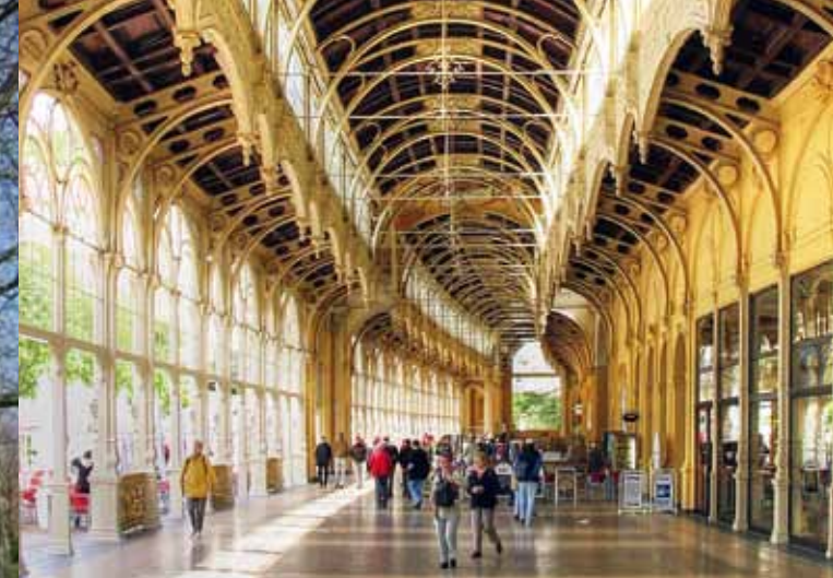
Bayreuth Opera House, picture above Marienbad, picture right above