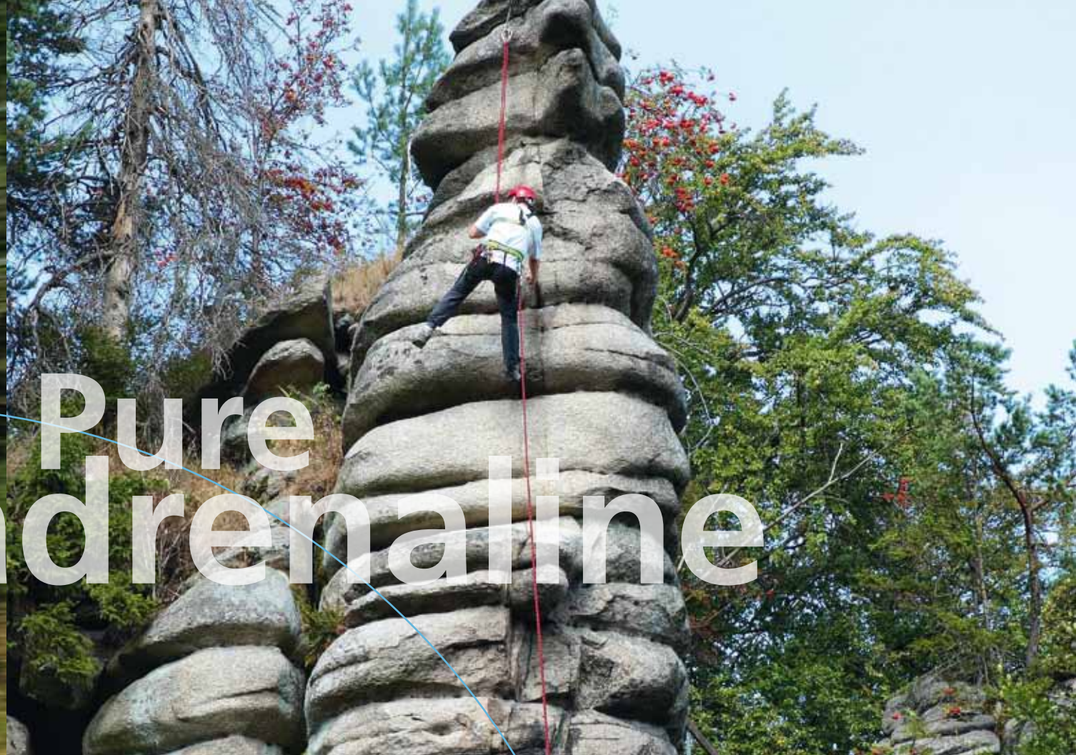
Climbing on the Rudolfstein