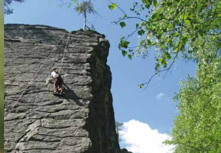
Climbing in Fichtelgebirge Nature Park