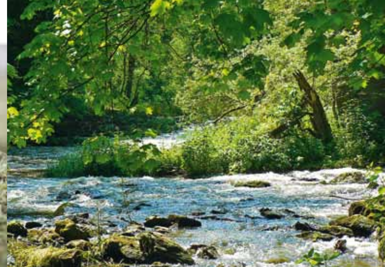
Stream in Fichtelgebirge