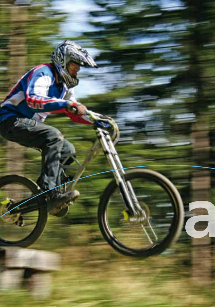
Downhill on the Ochsenkopf