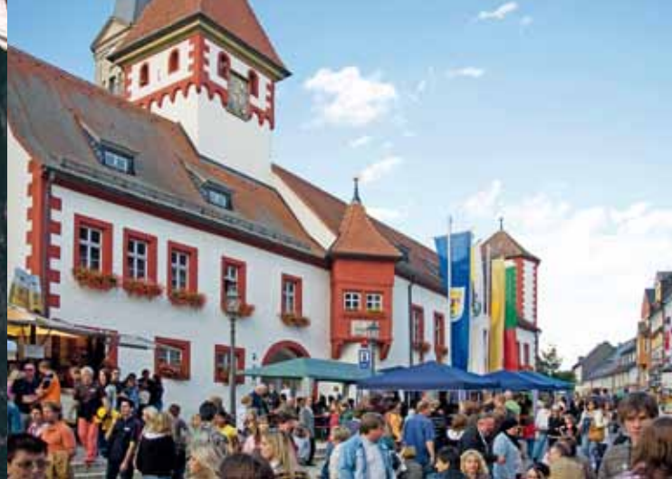
Pedestrian zone Marktredwitz

“Ich bin gern in dir geboren, Du kleine, aber gute, lichte Stadt”. (“I’m glad to be born in you, small, but sound, bright town”). This declaration of love to Wunsiedel was coined by the German poet Jean Paul (1763 – 1825). Since that time the nature of the town has hardly changed. Embedded in green valleys and surrounded by gentle hills and extensive forests, Wunsiedel is the centre of Fichtelgebirge Nature Park. As an important connection place between West and East, Wunsiedel has supported the peaceful interaction with the new neighbours since the opening of borders and gives new touristic and economic impulses by a mutual exchange. A particular attraction is the annual Fountain Festival when the 35 fountains of the town are colourfully decorated with flowers.