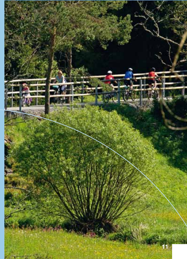
View over the Weißstädter See, picture above Brückenradweg Tröstau –Asch (bridge bicycle path), right picture