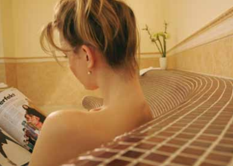
Wellness in Bad Alexandersbad