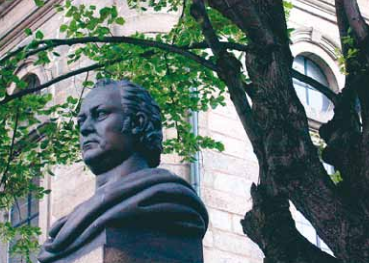
Statue of Jean Paul in Wunsiedel