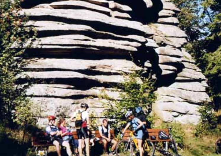
Rock formation in Fichtelgebirge Nature Park