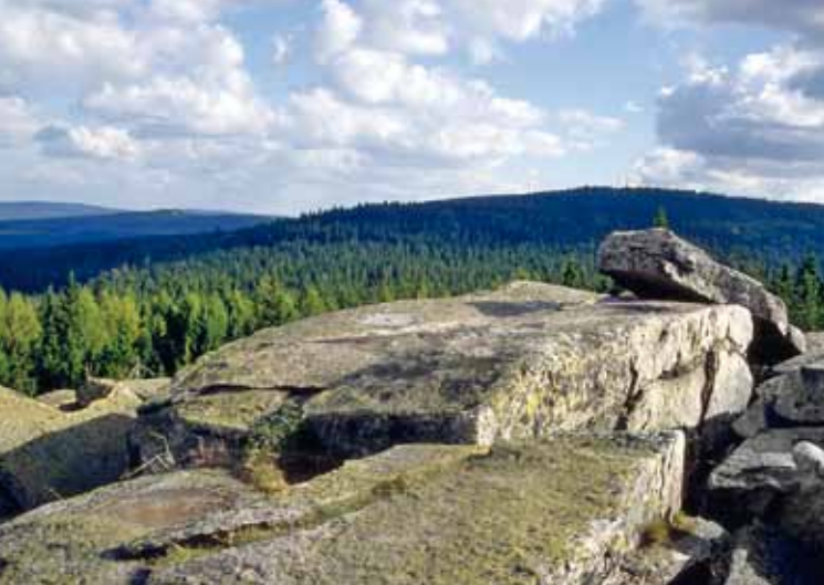
View from the Platte over the Seehügel to the Waldstein